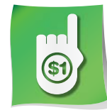
Covers from the First Dollar