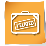
Loss & Delay of Baggage