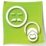
Covers All Ages