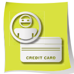
Fraudulent Credit Card Usage