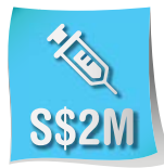
^ Overseas Medical Expenses Up To S$2,000,000 (Premier Plan)