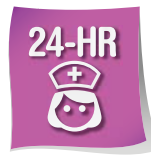
24-Hr Medical Assistance