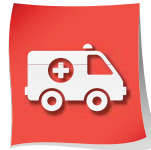
Unlimited Emergency Medical Evacuation (Superior & Premier Plan)