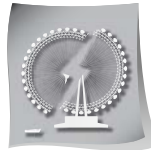
^ Disruption Benefits/ Entertainment Tickets/ Frequent Flyer Points